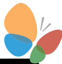
Table Sponsor Deadline | AUGUST 09, 2024